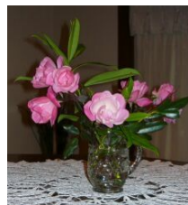
Ro. Co. Thanksgiving roses