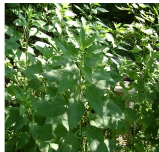
Young Jerusalem Artichoke

Thursday, December 10th 7pm @ Ag. Ext. Office Master Gardener Christmas Party