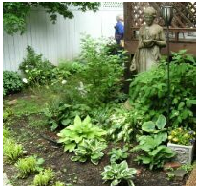
Garden of Linda Dickson

“Elegant topiaries and bonsai in the front yard, espaliered magnolias on the side segway nicely to stately holly trees trees in the rear. Visitors delight in the coral maples trees, leather leaf mahonia and in unique garden art scattered among the plants.” Lynn Stenglein